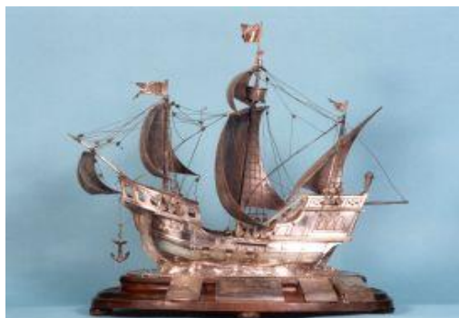
Original King of Spain Trophy